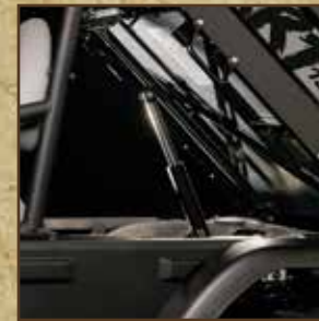
Electric Bed Lift