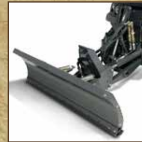
IntelliTach™ 62 in (157 cm) Plow Blade