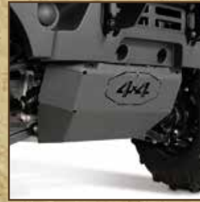
Front Skid Plate